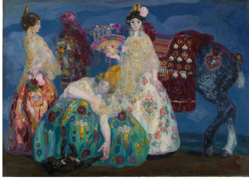
Girls of Burriana (Falleras) , oil Hermen Anglada Camarasa 1910-1911 Paris/France Hispanic Society of America, NY