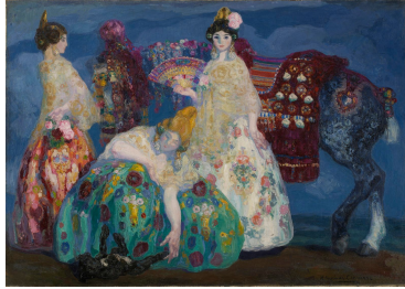
Girls of Burriana (Falleras) , oil Hermen Anglada Camarasa 1910-1911 Paris/France Hispanic Society of America, NY