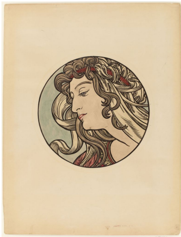
← Alfons Mucha (1860–1939), Study Medallion for the Façade of the Fouquet Jewelry Shop, circa 1900, pencil, wash and watercolor, Musée Carnavalet, Paris