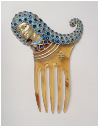
Eugène-Samuel Grasset (1841–1917), designer and Vever Frères, jeweler "Assyrian" Comb, 1900 horn, repoussé gold, cloisonné enamel, and cabochon sapphires Petit Palais, Paris