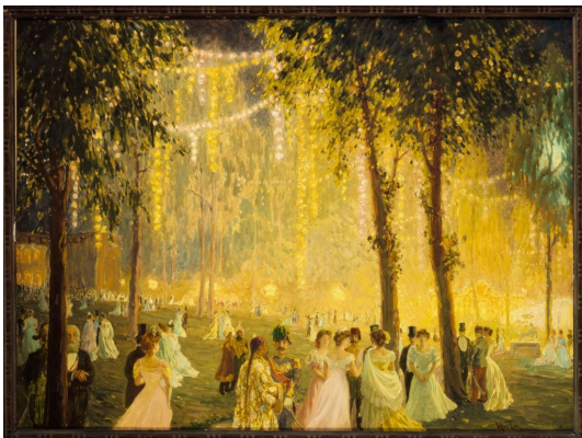
← William Samuel Horton (1865–1936), Nighttime Festivities Held by President Loubet at the Elysée Palace in Honor of Alfonso XIII, 1905, oil on cardboard, Musée Carnavalet, Paris