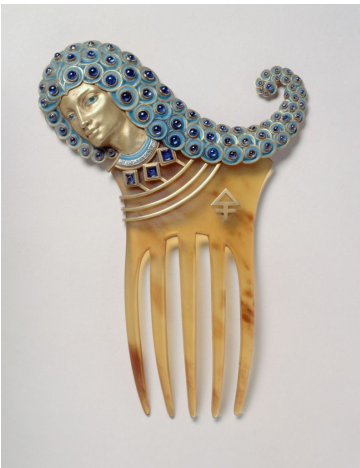
Eugène-Samuel Grasset (1841–1917), designer and Vever Frères, jeweler "Assyrian" Comb, 1900 horn, repoussé gold, cloisonné enamel, and cabochon sapphires Petit Palais, Paris