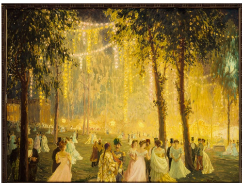
William Samuel Horton (1865–1936) Nighttime Festivities Held by President Loubet at the Elysée Palace in Honor of Alfonso XIII, 1905 oil on cardboard Musée Carnavalet, Paris